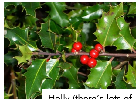
Holly (there's lots of this in Sutton Park!)